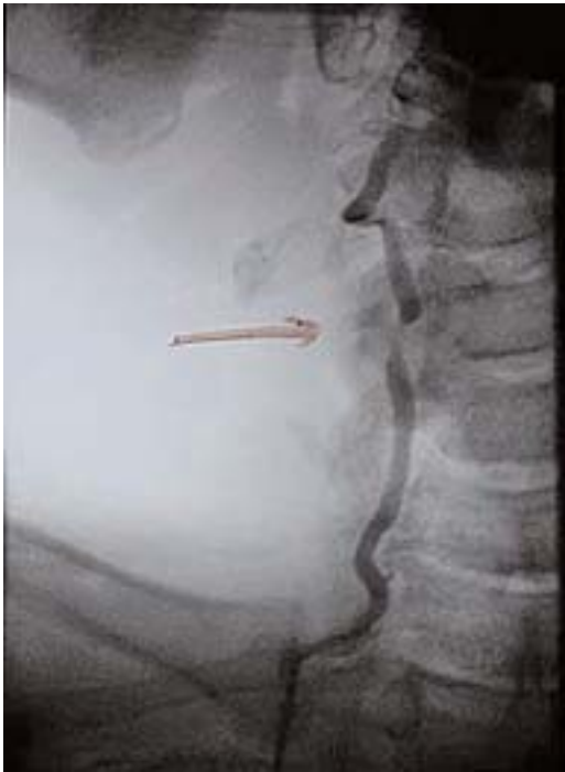
Fig. 1. Case 4. Large cervical disc herniation compressing the spinal cord at C5-6.